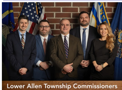
Lower Allen Township Commissioners

Lower Allen Township • 2233 Gettysburg Road • Camp Hill, PA 17011